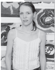
Gillian Welch Friday