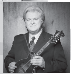
Ricky Skaggs Friday