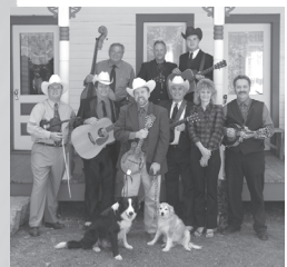
Cumberland Highlanders Thursday