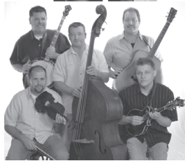
Illrd Tyme Out Thursday

Thursday-Friday-Saturday May 24-25-26, 2012