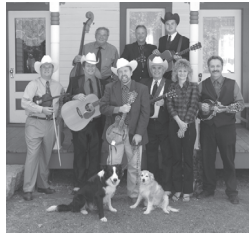
Cumberland Highlanders Thursday